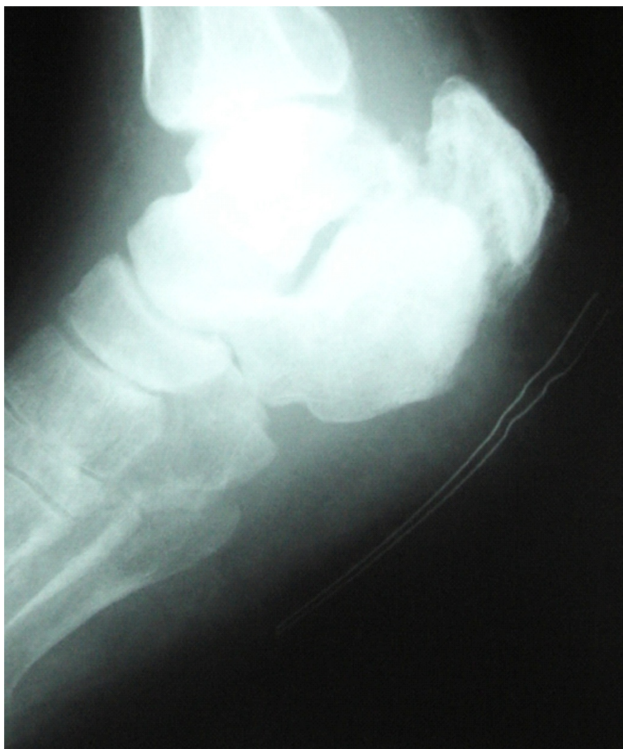
Figure 2 Standard Rx scan of the right heel at end of treatment.

osteomyelitis who were treated with Daptomycin at doses ranging between 3.2 and 7.5 mg/Kg/daily (median initial dose 5.6 mg/kg) were retrospectively evaluated in the CORE 2004 database. Among clinically evaluable patients with osteomyelitis, 63% were cured. In 48% of them, Daptomycin was given concurrently with other antimicrobial agents; MRSA accounted for 45% of the identified pathogens. In another series, a 94% success rate was observed in patients treated with Daptomycin alone [26]. Although renal transplant recipients are most intensely immunosuppressed early in the post-transplantation period, immunosuppressive therapy could not be tapered in our patient over the past 3 years and during treatment. Therefore, the efficacy of Daptomycin, in conjunction with the repeated local debridement, may have played a major role.