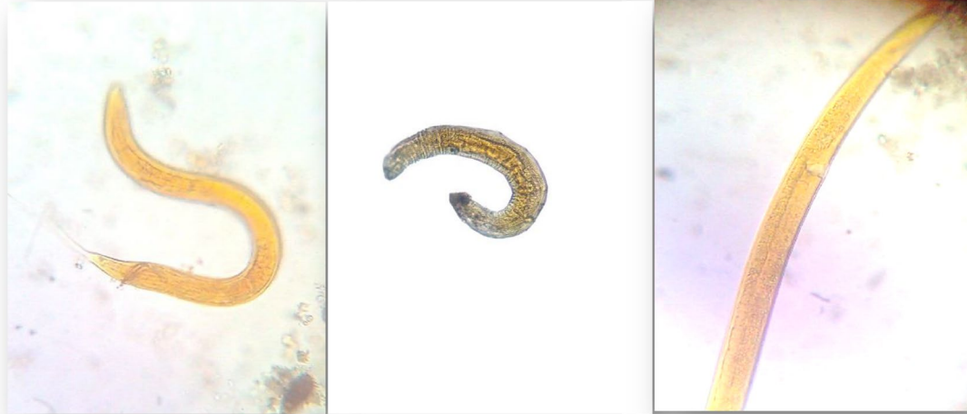
Fig. 3 Different non-pathogenic nematode larvae and adults (×40)

observation in accordance with finding by Damen (2007) [21].