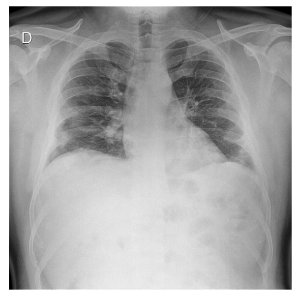
Fig. 1 Chest radiograph obtained on admission shows peripheral ground-glass opacities in mid- and lower-third of the thorax

Real-time reverse-transcription PCR (rRT-PCR) analysis of the patient's nasopharyngeal swab specimen indicated SARS-CoV-2 infection on the third day of admission. The test was performed at the Virology Reference Laboratory of the National Institute of Health, Bogotá, Colombia, as recommended by the WHO guidelines, following the protocol Charité, Berlin, Germany [23]. The laboratory confirmed the negative results for Influenza A and B by rRT-PCR. Sequencing of the strain from the patient was not performed.